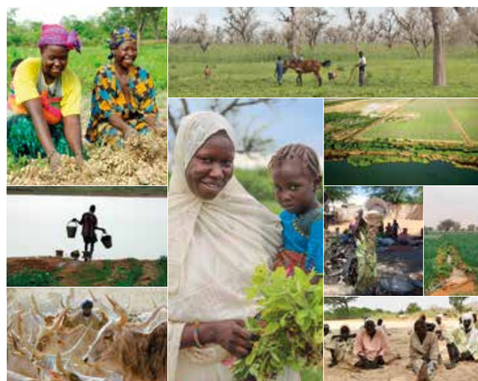
Photo credit: see the regional exchange workshop Report, page 125.

Despite their limited means, the projects feel the need to be supported by a federating structure capable of pooling their material and financial resources as well as their expertise. It could also address their need for capacity building through training on capitalisation , knowledge management, and the application of results.